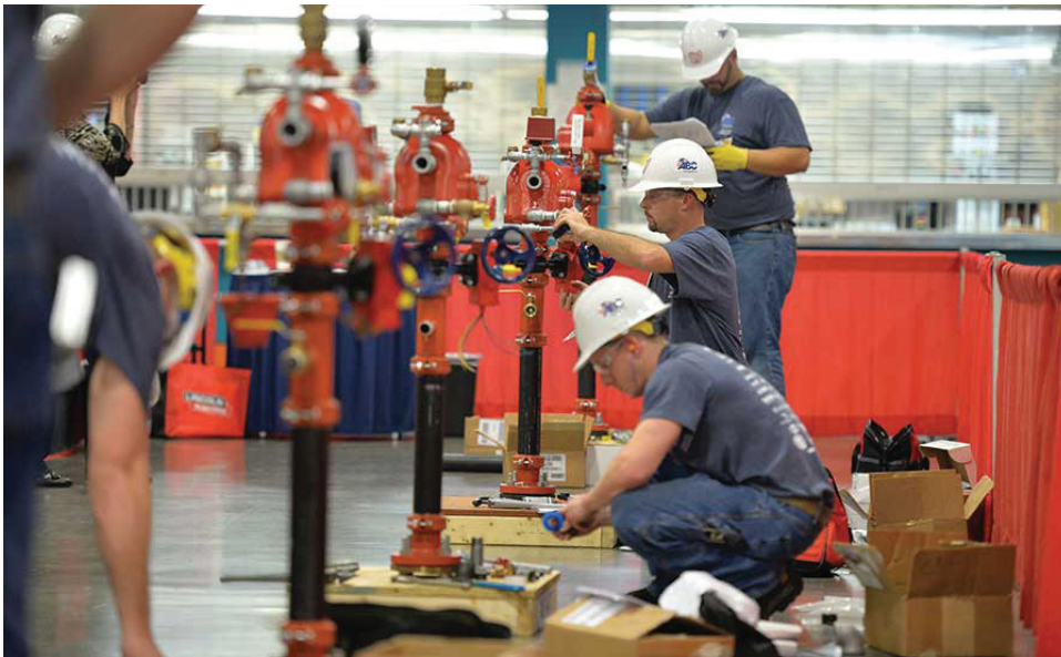
Competitors participate in the National Craft Championships at the Associated Builders and Contractors Conference in Ft. Lauderdale, Fla., in 2015.